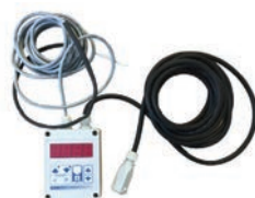
Remote thermostat THK with probe 4150.137