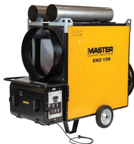
BIG POWER FOR BIG ROOMS!

Most other heaters on the market are incapable of reaching these high temperatures smoothly and are therefore unfit for thermal disinfection.