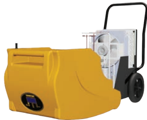
Easy to open for cleaning

The highly efficient DHP 55 dehumidifiers are ideal for small leaks, floodings and other drying tasks in construction, industrial or residential applications. Designed for professional use by rental companies, construction companies and more, the corrosion-resistant rotomoulded casing makes the units very sturdy and therefore perfect for a variety of challenging working conditions. Examples include areas such as basements, warehouses for food storage, archives, museums, libraries, garages and drying rooms. In general, it just comes in handy in connection with restoration after flooding or drying after construction work.