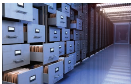
Storage, preservation and archives