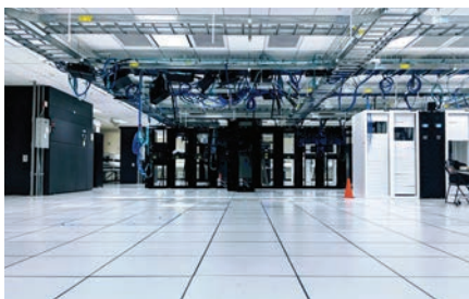
Data centres and telecoms