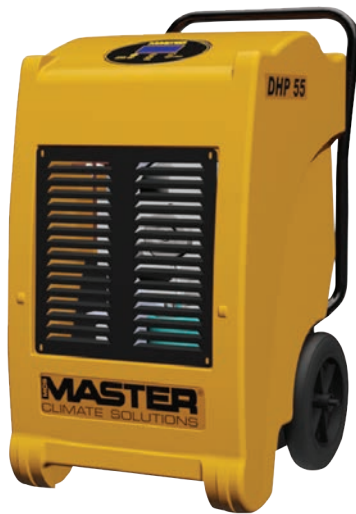
DHP 55 PATENT