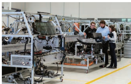
General industry and production