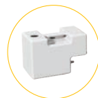
Water tank 5l 4250.320