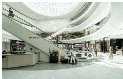
Buildings and commercial spaces